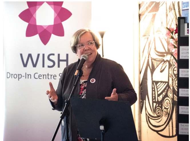
Libby Davies speaking at WISH Up-Close.

Special guest speaker Libby Davies, a long-time former MP, author, and activist inspired us with the following message. "For all of you who are in the room today who obviously care about this issue... what you're doing is so incredibly important. These issues are big and complex. It is that sense that what we do is bigger than ourselves. It's about taking on these systemic issues – whether it's racism – whether its homophobia